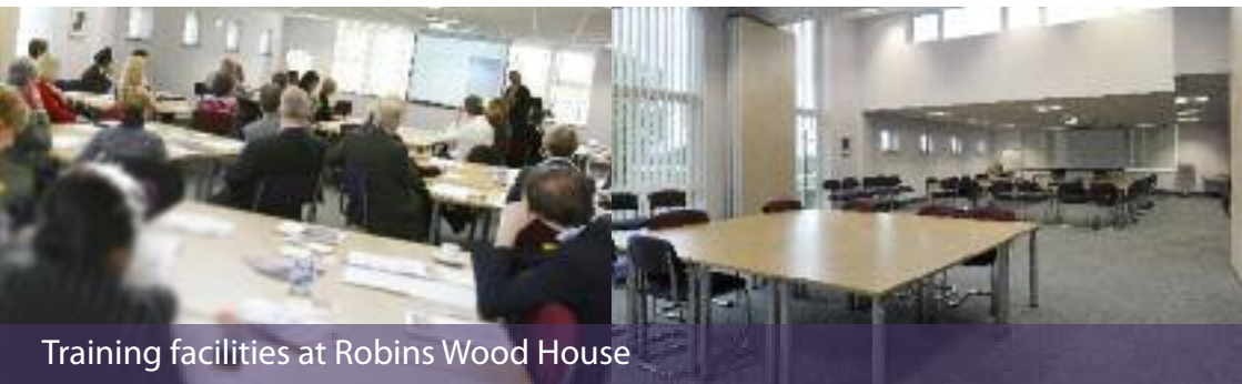
Training facilities at Robins Wood House

1946 - In a landmark document innocuously entitled 'Circular 87', the then Ministry of Education proposed that further education be organised on a regional basis, and that Regional Advisory Councils be established. The Councils would bring together local education authorities, universities, technical colleges and representatives from industry and commerce.