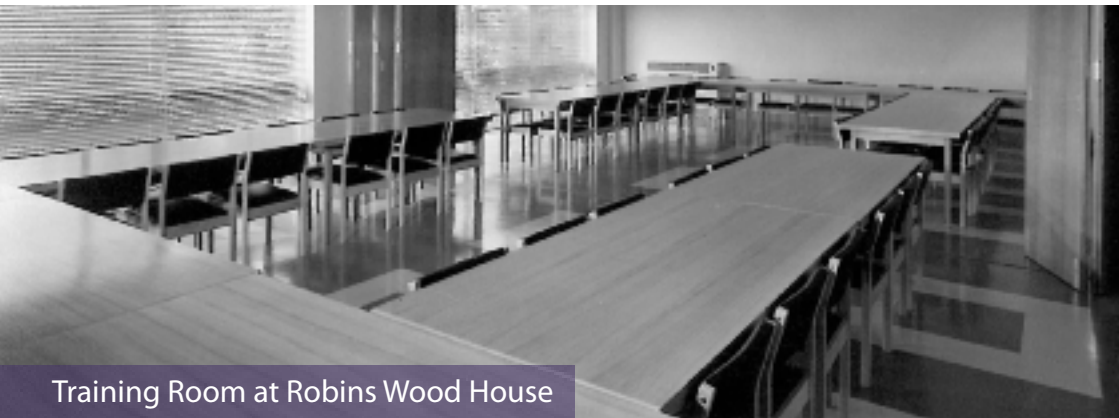
Training Room at Robins Wood House