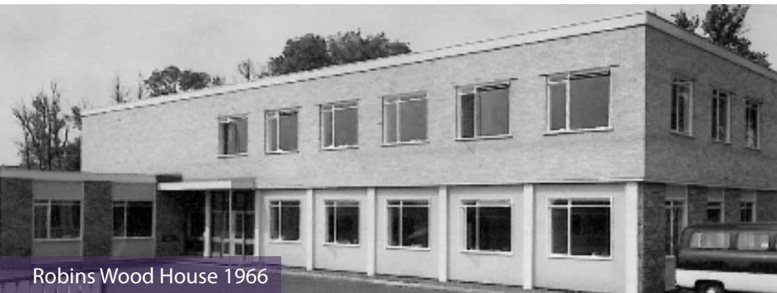
Robins Wood House 1966