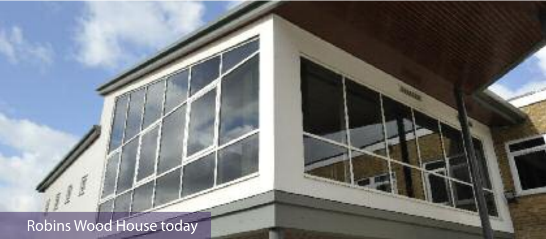
Robins Wood House today